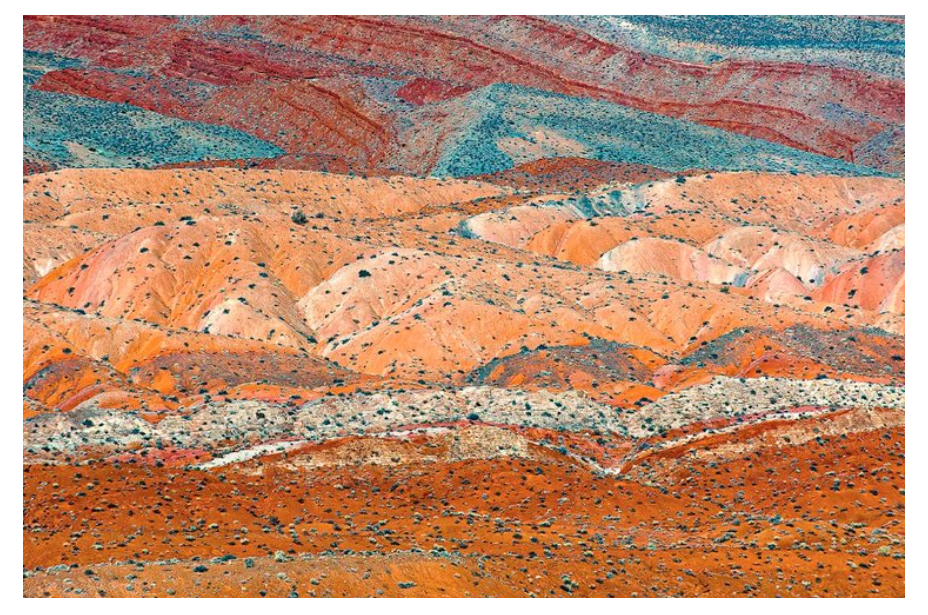
Obstacle by Kien Pham, U.K.

" Obstacle is a metaphor for overcoming the problems in the world. Although at first, it seems like an impenetrable barrier, the columns rotate allowing visitors to enter and interact with the obstacle, and other visitors. In order to confront the obstacle, visitors have to work together, rotating the columns in sequence to overcome the adversity."