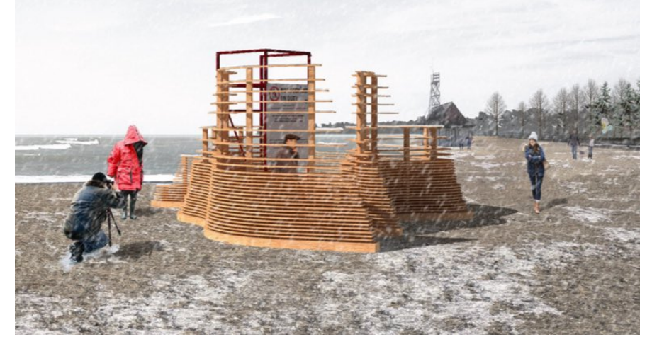
Rising Up by the University of Guelph, School of Environmental Design and Rural Development, Canada.

" Obstacle is a metaphor for overcoming the problems in the world. Although at first, it seems like an impenetrable barrier, the columns rotate allowing visitors to enter and interact with the obstacle, and other visitors. In order to confront the obstacle, visitors have to work together, rotating the columns in sequence to overcome the adversity."